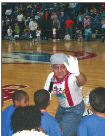
Leaders and Children at the Celebration

CCR&R staff. Several CSU early childhood candidates assisted with this very successful event.