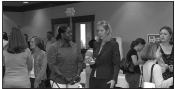
Guests at the MRA 2007 Spring Literacy Conference